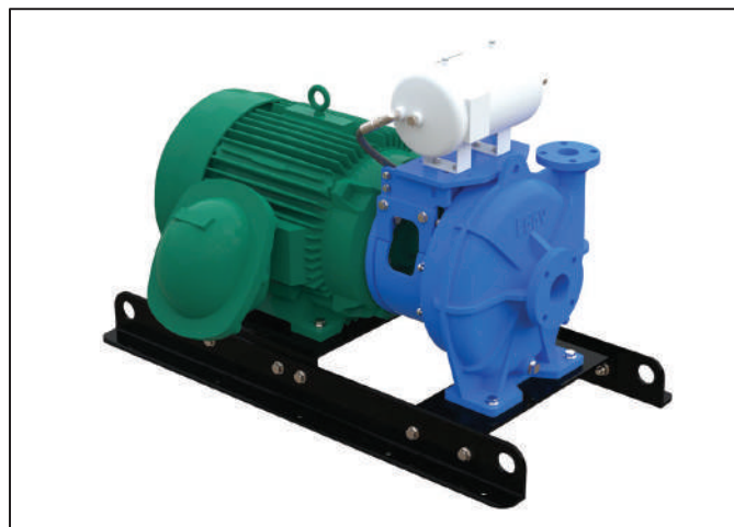
*Typical Deployment Photo. Dredge pumps can be deployed vertically or horizontally. Photos for general guidance. Contact us for further details.