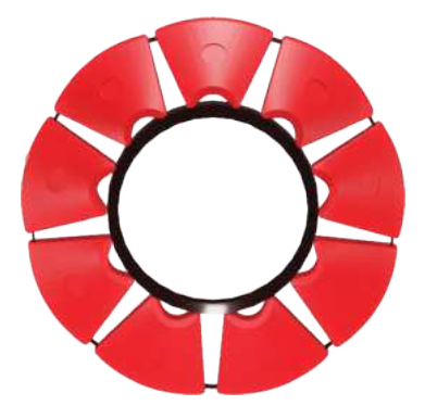
24 inch pipe 9 float units